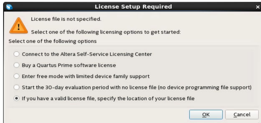
Figure 5. License Setup Required Dialog Box